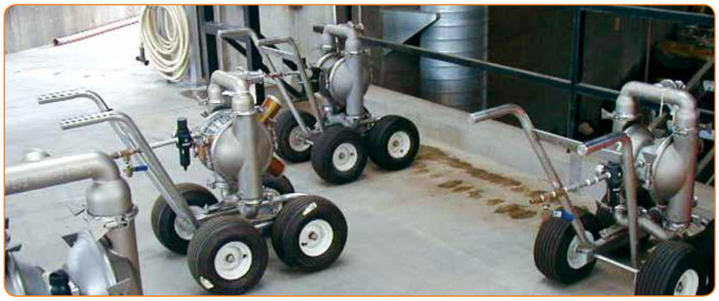
In order to meet growing demand while producing desired products, global winemakers are turning more and more to Wilden® AODD pumps for use in their precise winemaking processes.