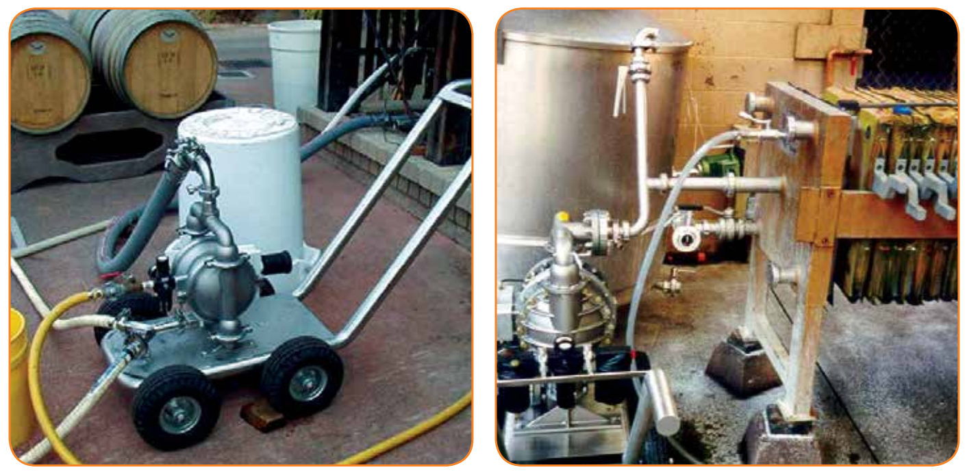
The operational advantages of using AODD pumps in winemaking processes are many, including easy to clean and maintain; gentle handling of delicate fluids; capable of moving large volumes; seal-less design; and portability.