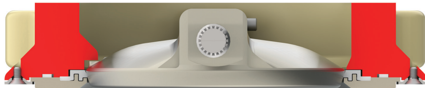
High-cycle soft seat arrangement on Valtek Valdisk valve

To ensure the valve seat works as intended, Flowserve tested it under real-world conditions to verify it can meet the cycle demands of PSA applications.